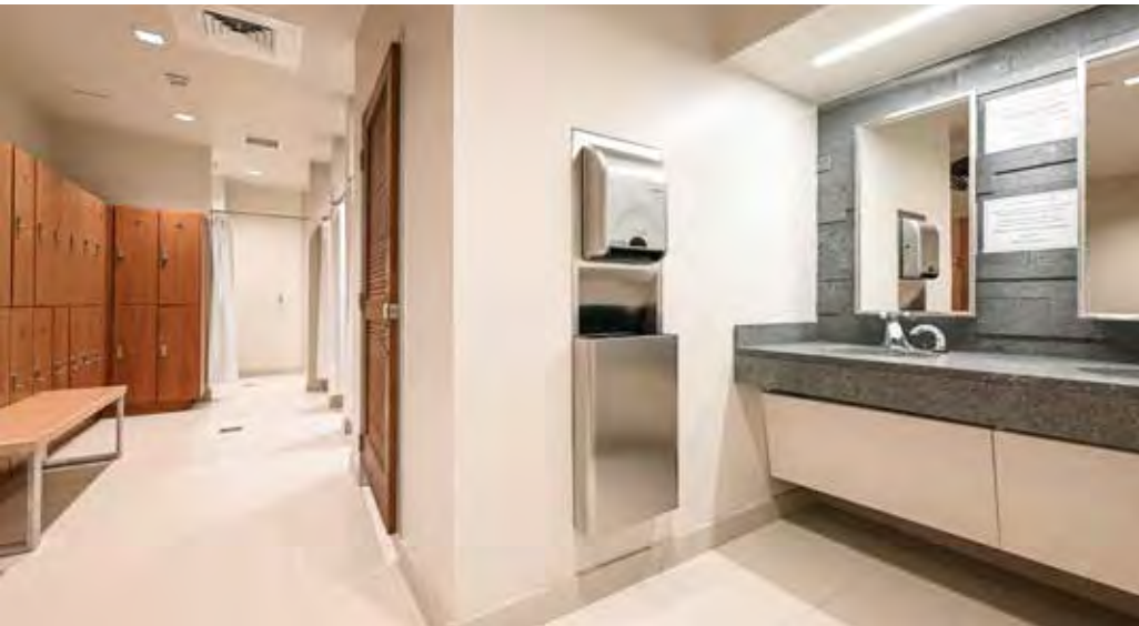
Spa-Quality Changing Room For Fitness Center