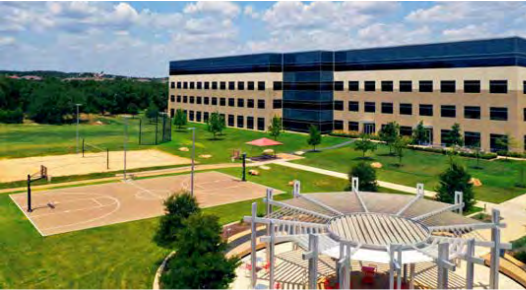
Huge Lawn With Sport Court And Sand Volleyball