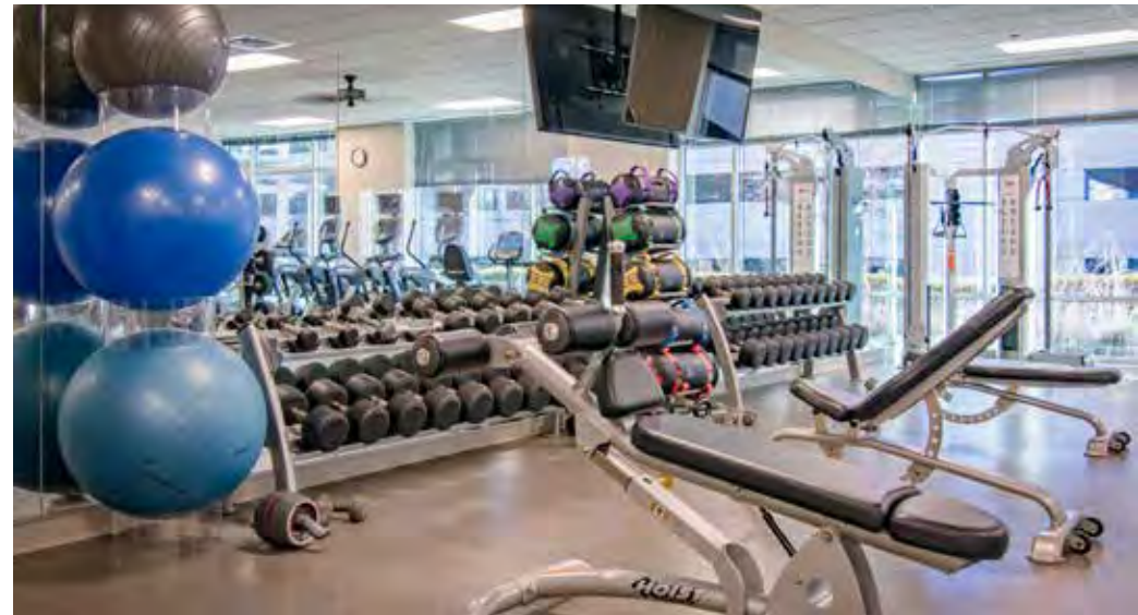
Large Fitness Center With Modern Equipment

WILL CRAWLEY 512.682.5551 wcrawley@endeavor-re.com