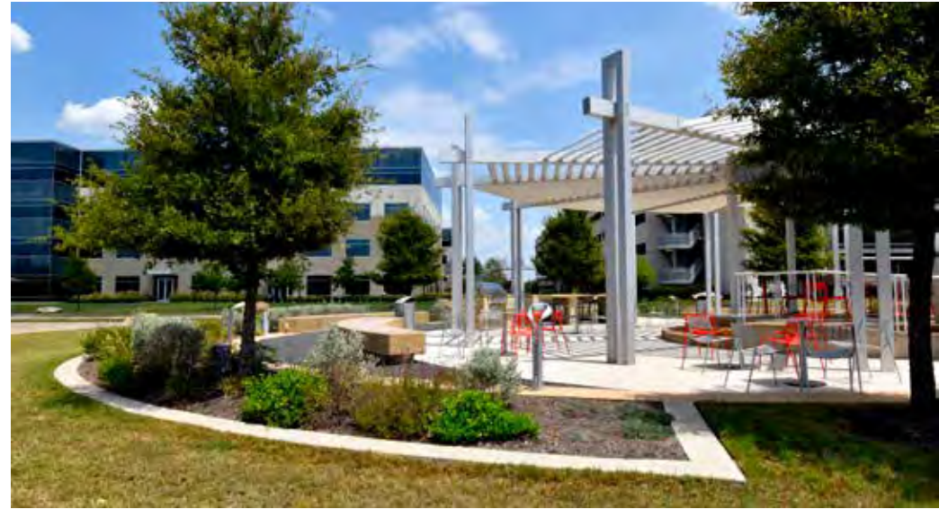
Pavilion With Gas Grill And Outdoor Seating